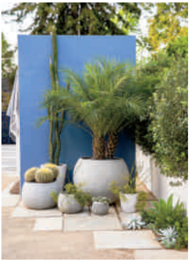
1. DESERT MODERN