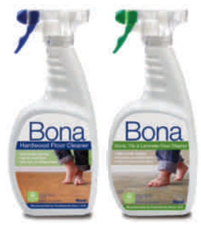
Available for both Hardwood and Stone, Tile & Laminate floors

When life happens in your home, trust Bona °.