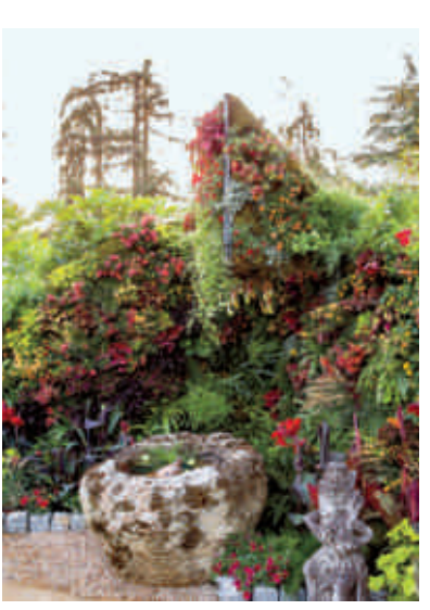
- 5. TROPICALI -