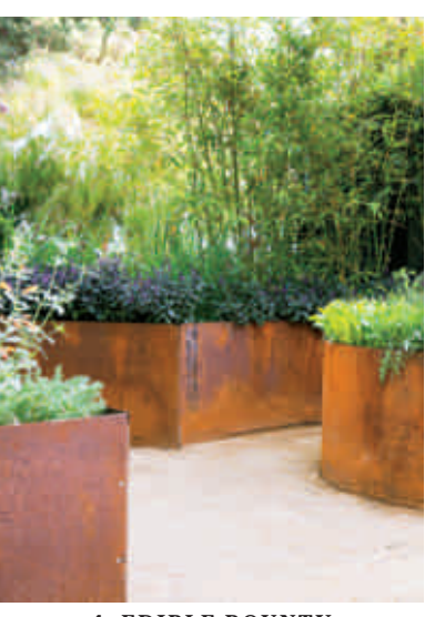
– 4. EDIBLE BOUNTY –